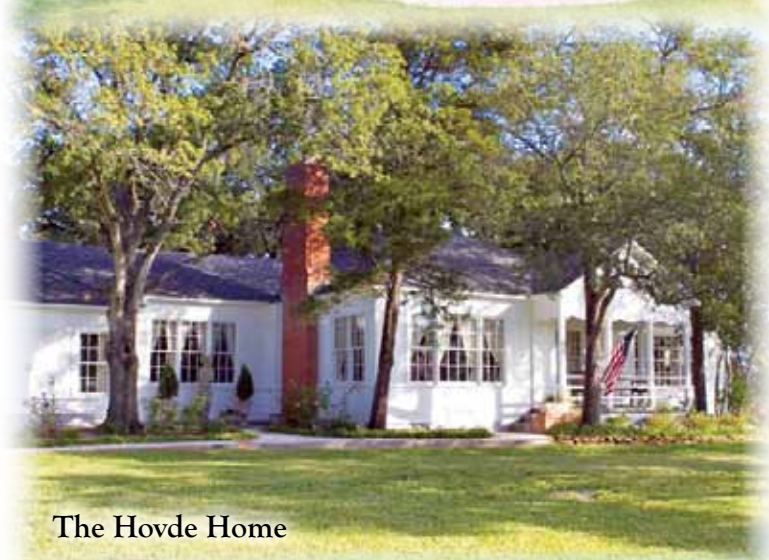
The Hovde Home