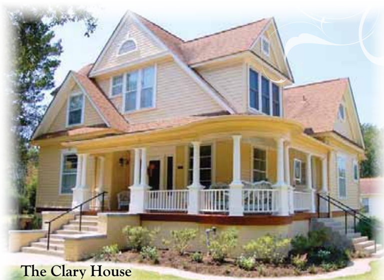
The Clary House

Tickets for the Woman's Club House and Garden Tour are $15 and can be obtained from any Woman's Club